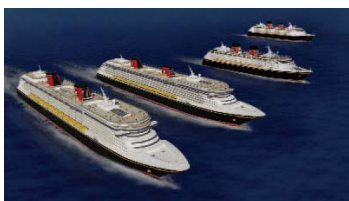
Disney Cruise Line recently announced plans to expand its cruise business by adding two new ocean liners, scheduled to launch in 2011 and 2012.

Disney Vacation Club is also continuing to build Disney's Animal Kingdom Villas at the Walt Disney World Resort, where accommodations feature intricate African-inspired details, home-like amenities and – from most villas – sweeping views of a savanna inhabited by a variety of African animals. Following the opening of Kidani Village at Disney's Animal Kingdom Lodge, Disney Vacation Club is scheduled to open in 2009 the Treehouse Villas at Disney's Saratoga Springs Resort & Spa, Bay Lake Tower at Disney's Contemporary Resort and The Villas at Disney's Grand Californian Hotel & Spa.