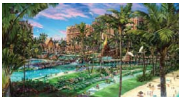
The luxury resort in Hawaii, Ko' Olina, as envisioned in the artist's rendering, is scheduled to open in 2011.