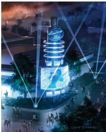
Experience the rush of performing for a live audience at the new American Idol attraction.