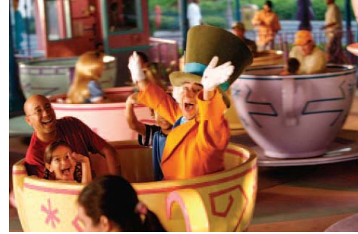
Walt Disney World Guests enjoy a fun-filled day with the Mad Hatter on the Mad Tea Party.

Walt Disney Parks and Resorts (WDP&R) is where dreams come true and magic comes to life. Its story began more than 50 years ago when Walt Disney – already one of the most celebrated filmmakers in America – dreamed up a new kind of family entertainment. Walt got the inspiration for this new venture after taking his daughters to local Southern California amusement parks on the weekends. He found himself bored, sitting on a bench with nothing to do while his daughters played.