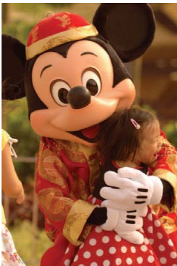
A young Hong Kong Disneyland Guest is embraced by her favorite Disney character, Mickey Mouse

WDP&R continues to create magic outside its theme parks – in exciting and innovative ways, and in new and different places. In 2007, WDP&R announced the purchase of 21 acres in Hawaii on the island of Oahu to build a luxury family resort. The property, located on the island's western side in the picturesque Ko' Olina Resort & Marina, one of Honolulu's premier resort destinations, will be home to Disney's first mixed-use family resort outside of its theme park developments. The expansive resort, scheduled to open in 2011, will have more than 800 units including hotel rooms and villas for Disney Vacation Club.